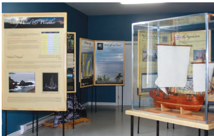
Indeavour Saga Exhibit